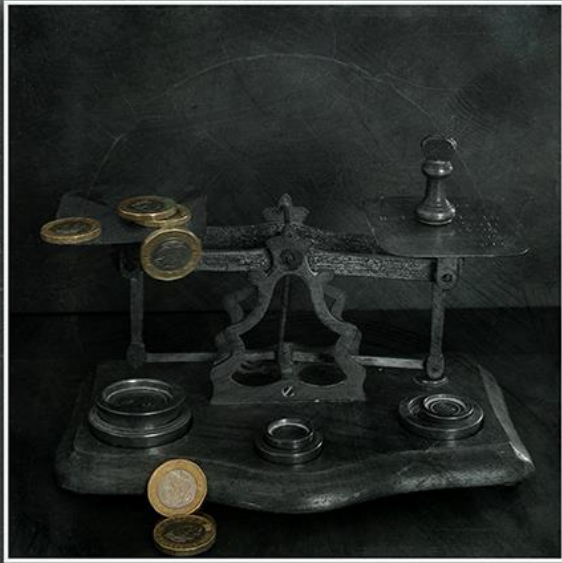
The Falling Pound