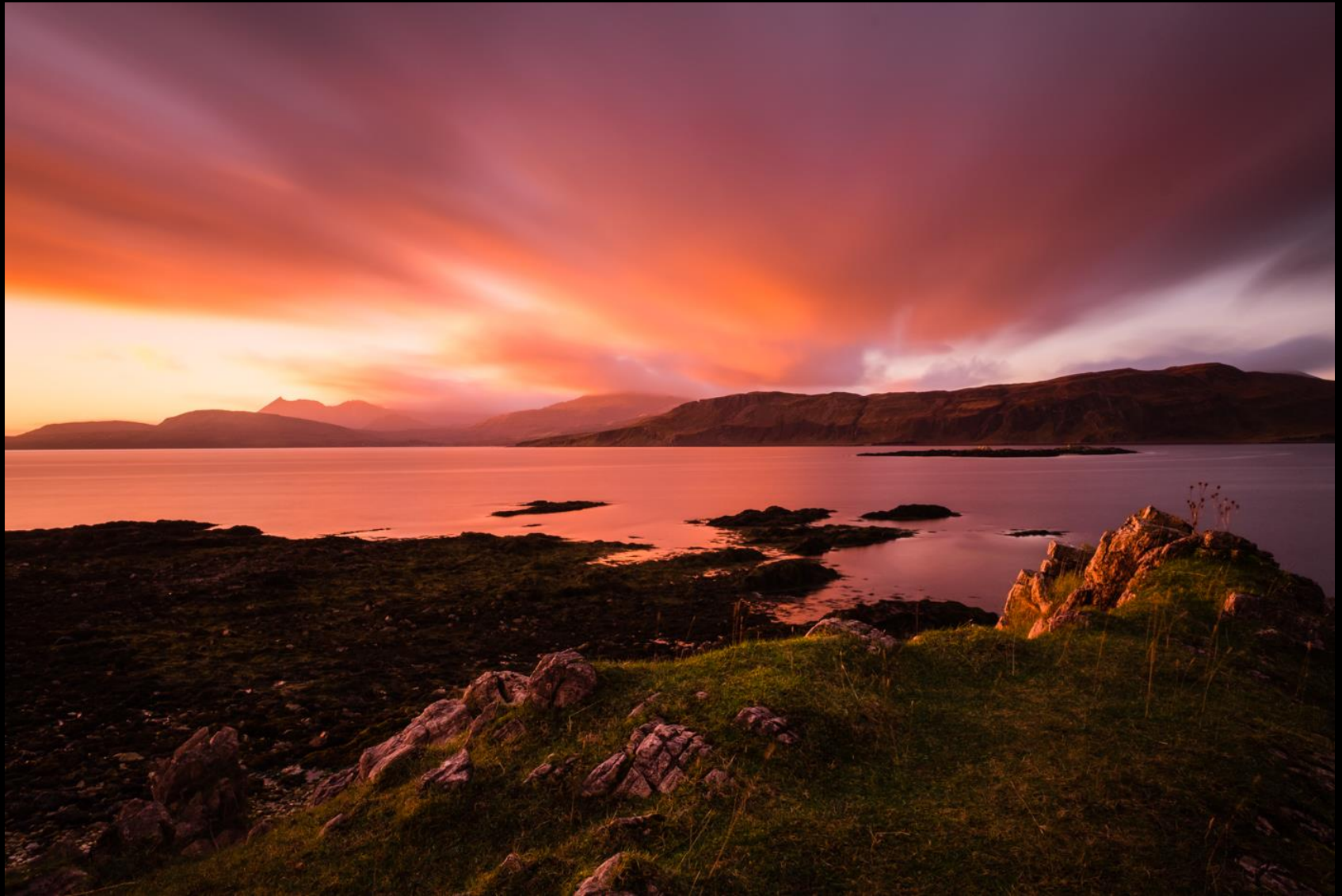
4th Projected Landscape Neil Forster – Sunset over the Cuillins