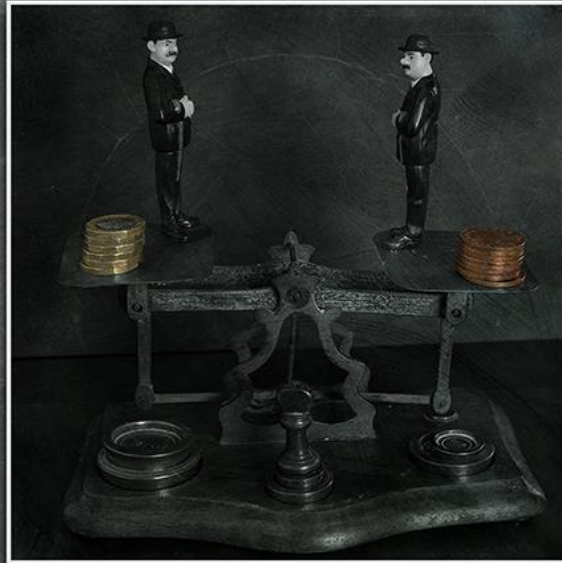
Pounds to Pennies